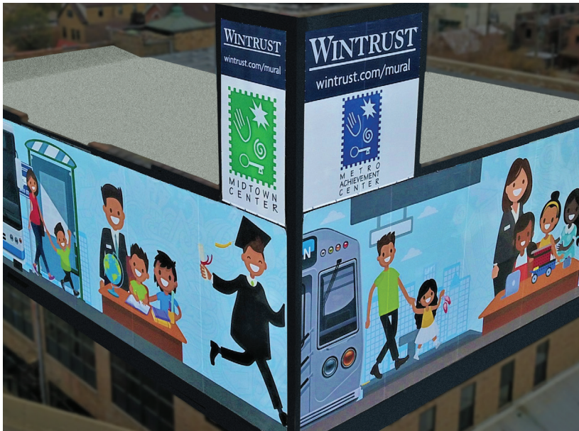
Drivers on the Kennedy Expressway were reminded of MEF's work this past year through the Wintrust mural, which featured MEF for two months.